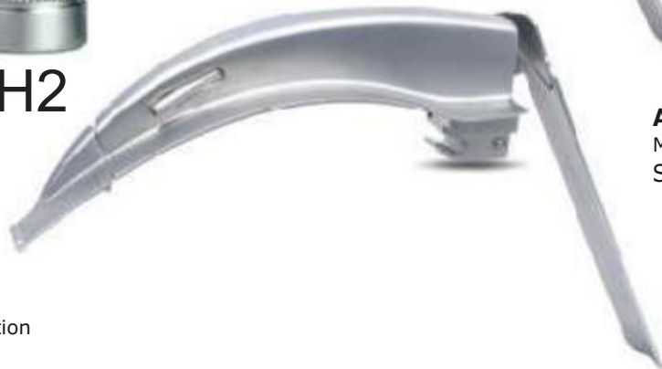
A - 12006-B3

McCoy Blade Fiber Optic Illumination Size: 2