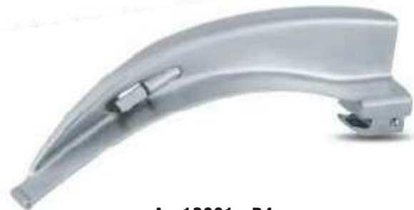
A - 12001 - B4

Mc - Intosh Blade Standard Illumination Size: 3