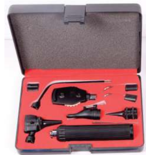
ENT Diagnostic Set Black Colour in Box Packing.