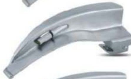
A - 12001 - B1

Mc - Intosh Blade Standard Illumination Size: 0