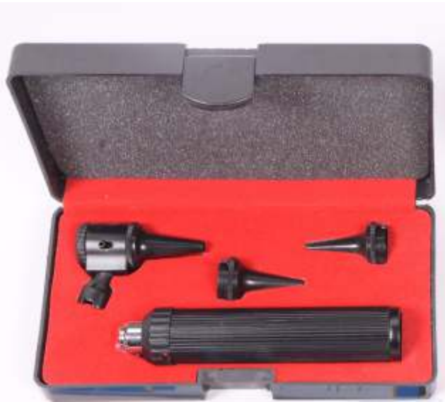
ENT Diagnostic Set Black Colour Coated