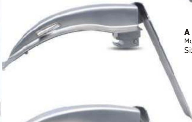
A - 12006-B2

McCoy Blade Fiber Optic Illumination Size: 1