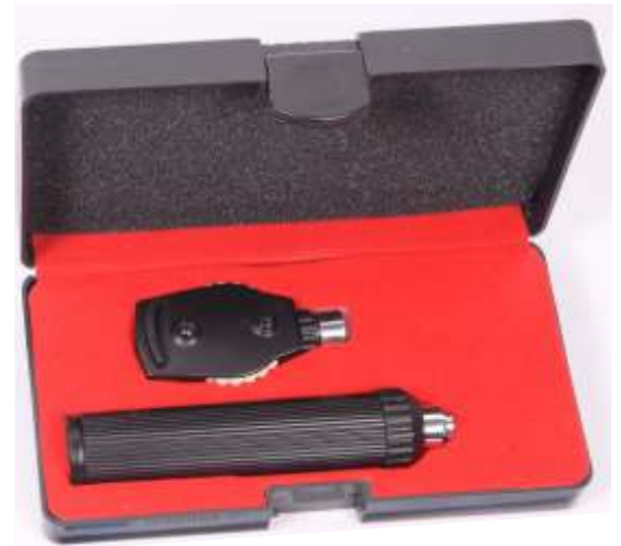
Ophthalmoscope Set Balck Colour Coated