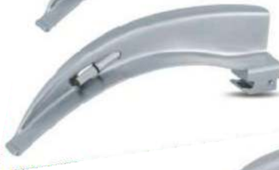
A - 12001 - B3

Mc - Intosh Blade Standard Illumination Size: 2