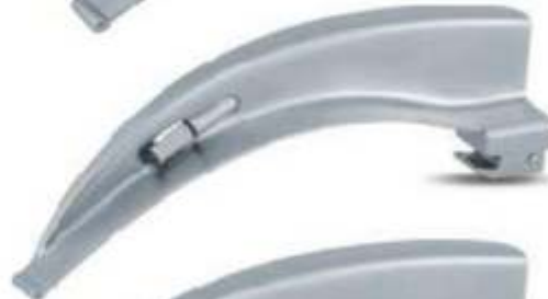
A - 12001 - B2

Mc - Intosh Blade Standard Illumination Size: 1