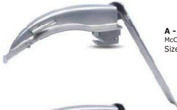
A - 12006-B1

McCoy Blade Fiber Optic Illumination Size: 1