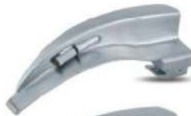
A - 12001 - B0

Mc - Intosh Blade Standard Illumination Size: 0